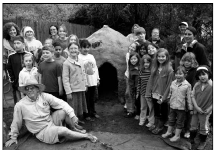
After a hard day's work on the natural playhouse!