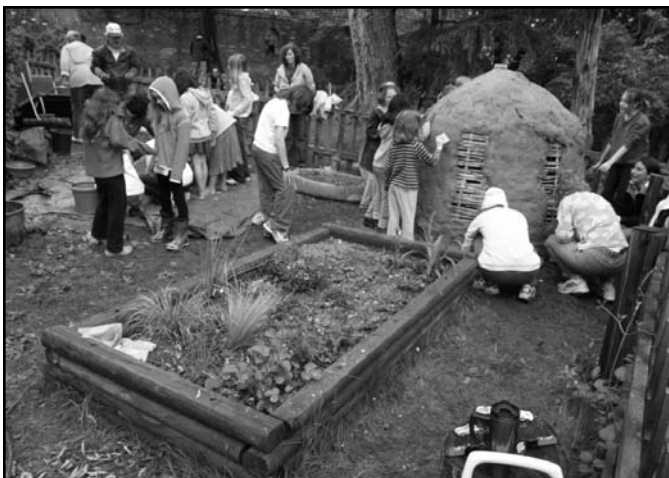
Religious Education children and parents working on the mud-daub natural playhouse