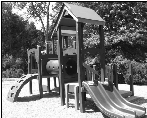
Our beautiful new play structure!