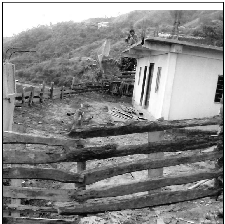
Pictured above is the new school building built by Mawlat UUs for its students in grades 8-10; shown on the left is the plaque commemorating MVUC's support in this undertaking.